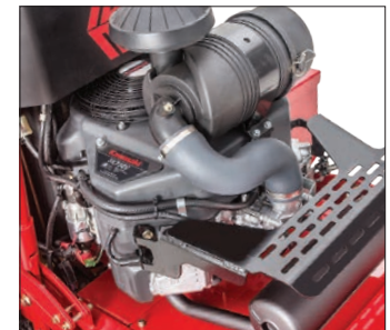
Venom | Kawasaki Engine