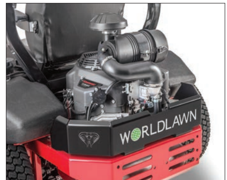
King Cobra Maxx | Engine View

3 YEAR PARTS & LABOR LIMITED DECK 10 YEAR WARRANTY