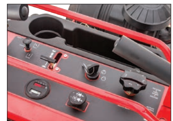
Venom | Control Panel

3 YEAR PARTS & LABOR LIMITED DECK 10 WARRANTY