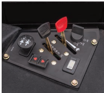
Python | Control Panel