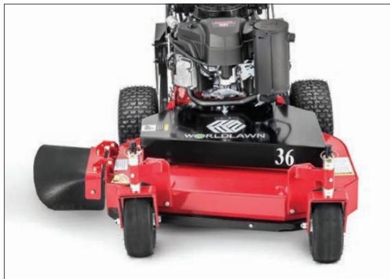
BELT SERIES | Front View