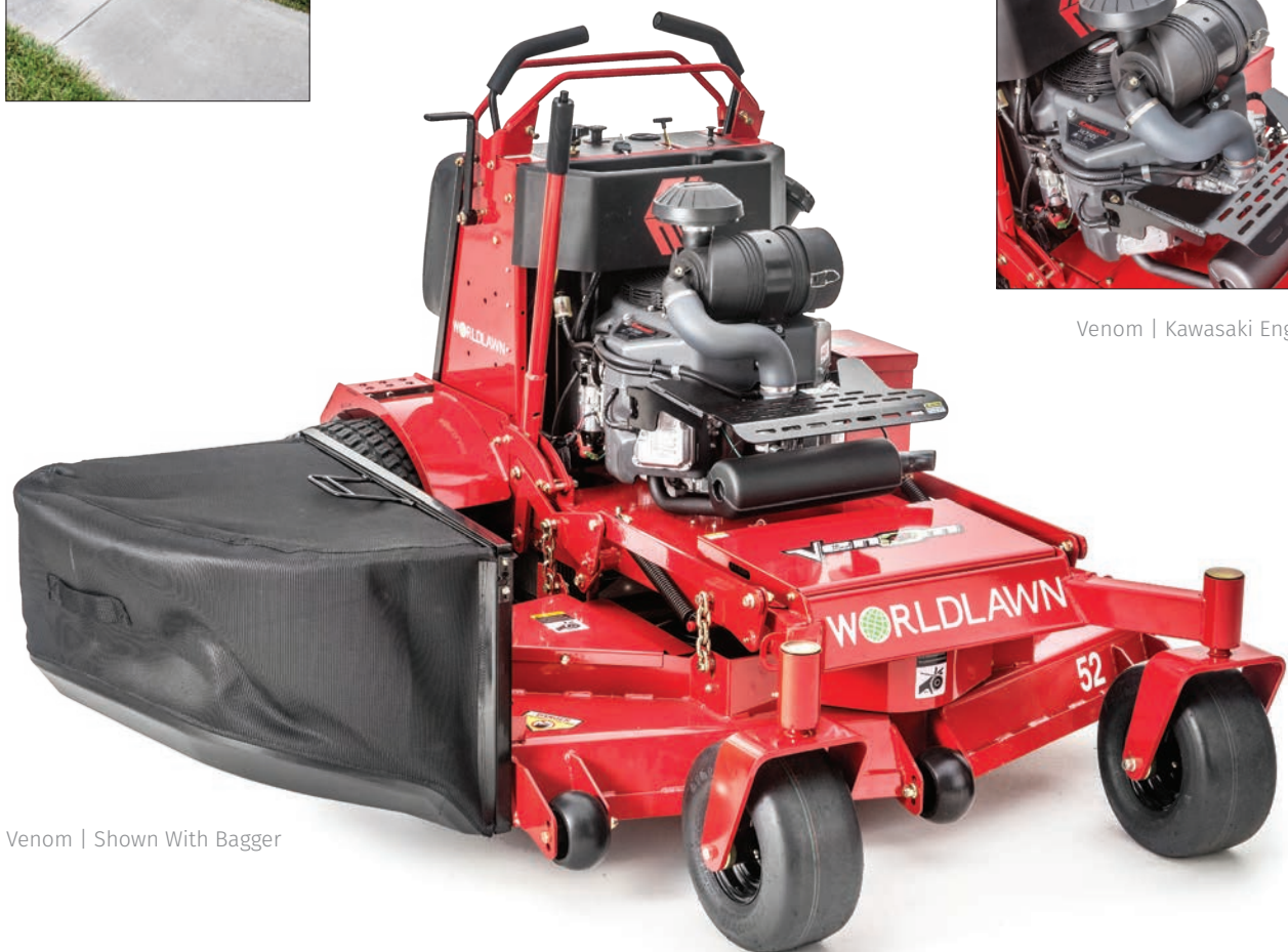
Venom | Shown With Bagger