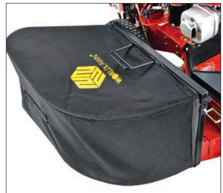
Walk Behind | Grass Catcher